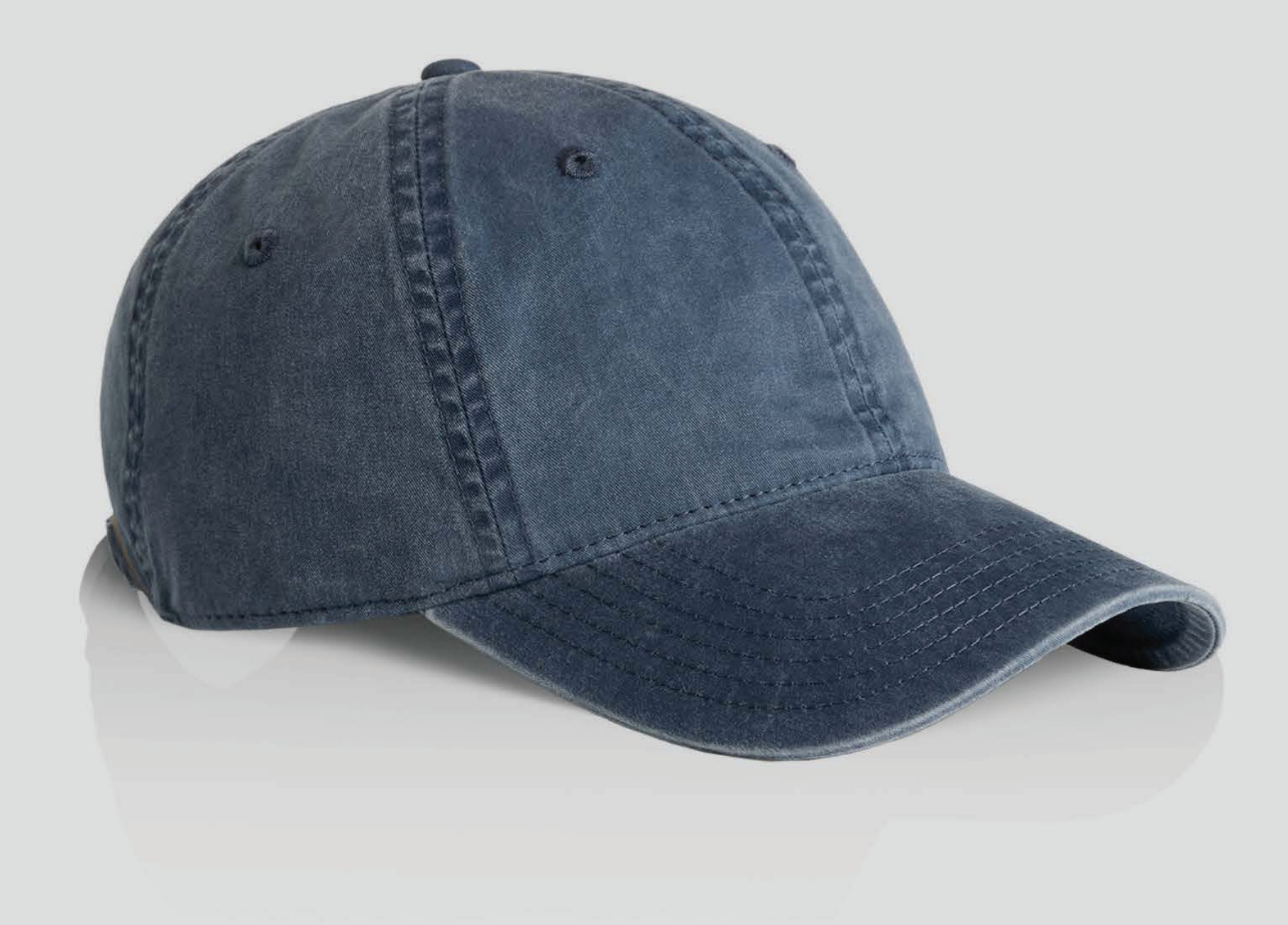
TEAR OUT LABEL